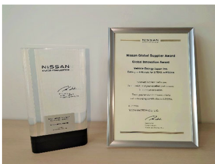
Plaque and Certificate

VE-J continues to strengthen our battery products, including lithium-ion battery systems, packs, and battery modules, that directly contribute to the transition and popularization of electrified vehicles and to the preservation of the global environment.